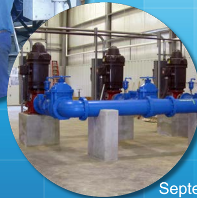
September 13-16, 2020