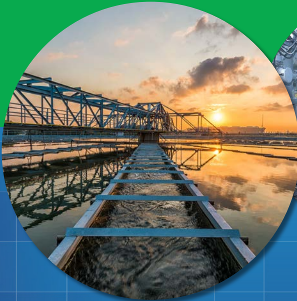
Missouri Municipal League Virtual Fall Conference